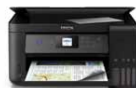
EcoTank L4160 All-in-One Printer