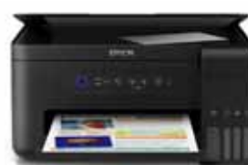
EcoTank L4150 All-in-One Printer

The design of the new EcoTank printers makes them sleek and compact. With the tank integrated into the printer, these printers have the smallest footprint* amongst all brands of ink tank printers. Enjoy spill-free refilling with individual bottles which have unique nozzles that fit only into their respective tanks. Auto-duplex printing** affords users up to 50% savings on paper costs by printing automatically on both sides of paper. Remain connected with the option to print wirelessly over network or directly from your mobile devices using Wi-Fi Direct. Rejoice in exceptional print quality with the use of pigment black ink which produces water and smudge-resistant printouts.